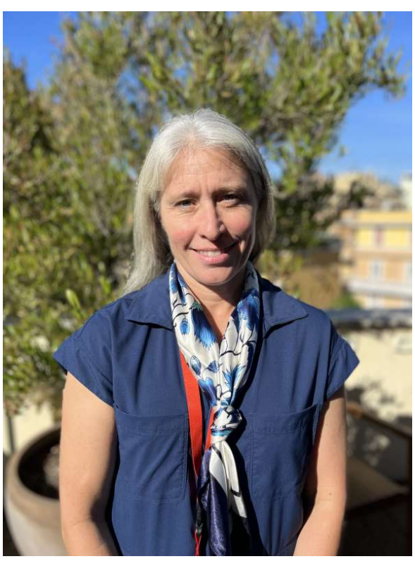
Stacey Noem USA